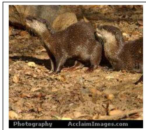
Olivia & Oscar Otter

Last week Oscar & Olivia Otter got married, and are expecting 2 kits.