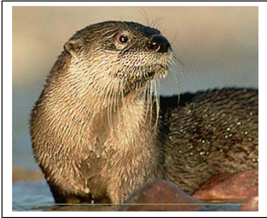
Oliver at the Hudson River shoreline.

As we all know the human is our worst predator and we are on the lookout for them. Last night Mayor Otter hired two otters to protect the village from humans. Humans are our worst predator because they hunt us for our rich brown fur.