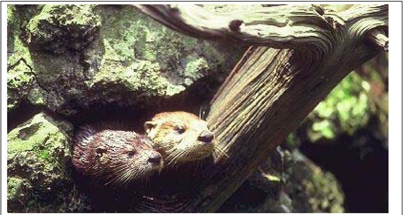
Rocky & Rebecca in their new den.

Rocky & Rebecca found a den on the Hudson River shoreline, got married last month, and are expecting babies in 10-12 months.