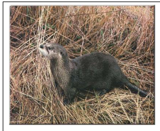
Owen Otter on the lookout.

Owen Otter makes sure river otters are very careful crossing the roads at night. If they do cross the road, they might get hurt.